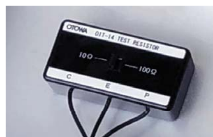
The test resistor

The simple operation check can be performed, in order to confirm the proper measurement by this product