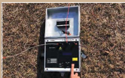
Example of use

Transient grounding impedance (effective surge impedance) due to lightning etc. is different from normal grounding resistance, because it is influenced by the reactance and capacitance contained in the ground. It is very important to measure the transient grounding impedance in a ground pole at lightning protection equipment, leg of power transmission tower, leg of communication antenna tower etc. where lightning surge current flows into them.