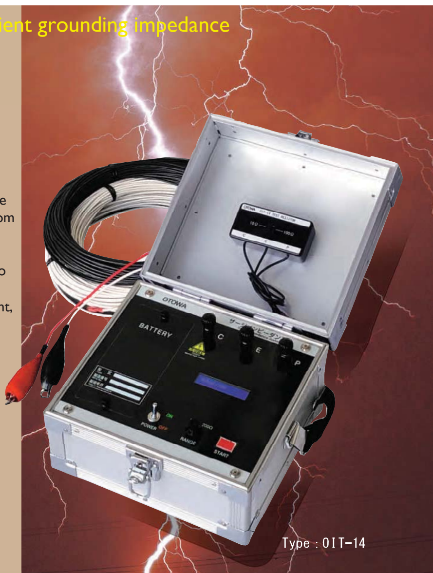
Type : OIT-14

○ This product can measure transient grounding impedance without removing the overhead ground wire of the transmission tower.